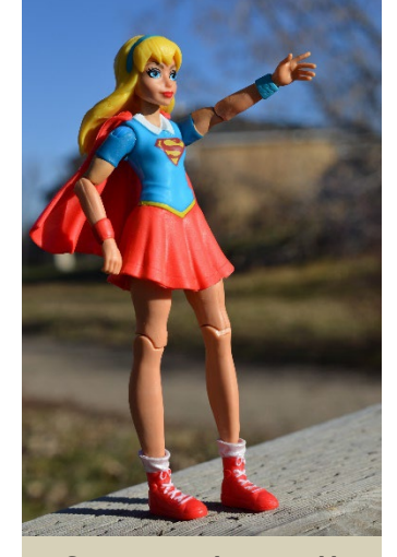
Supergirl - well known for her super strength and super speed - had beaten Superman to the action.

Ready for action, Superman (wearing his trademark red cape) called his friends to join him in the fight against evil.